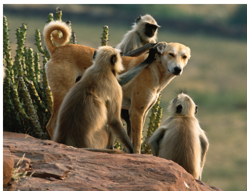
A dog being groomed by langurs, Rajasthan, India.

To order online: www.ucpress.edu/9780520260245 FOR A 20% DISCOUNT USE THIS SOURCE CODE: 11M1964 (please enter this code in the special instructions box. Discount only available on books shipped to North America, South America, Australia, and New Zealand.)